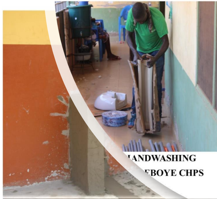
INSTALLATION OF HANDWASHING STATION AT AMPATIA FREBOYE CHPS