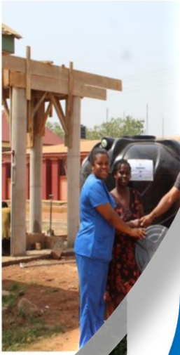
DELIVERY OF MATERIALS AT AMPATIA FREBOYE CHIP