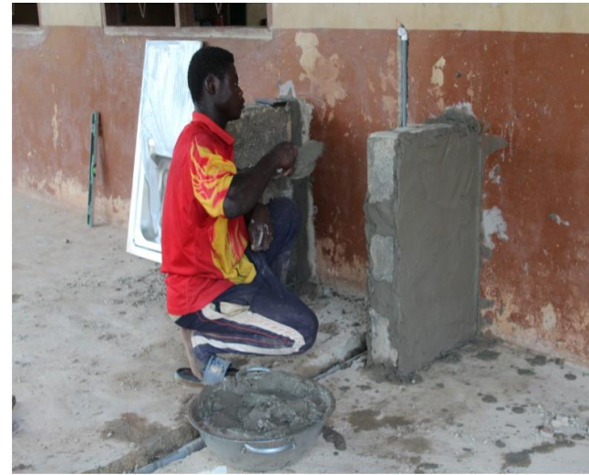
CONSTRUCTION MONITORING AT ANWIASO TWEAPEASE SCHOOL