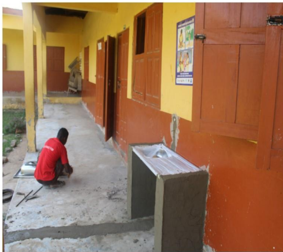
HANDWASHING STATION AT ABOABO