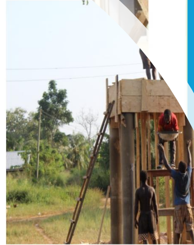
CONSTRUCTION OF PO AT ANWIASO TWEAPEASE SCHOOL