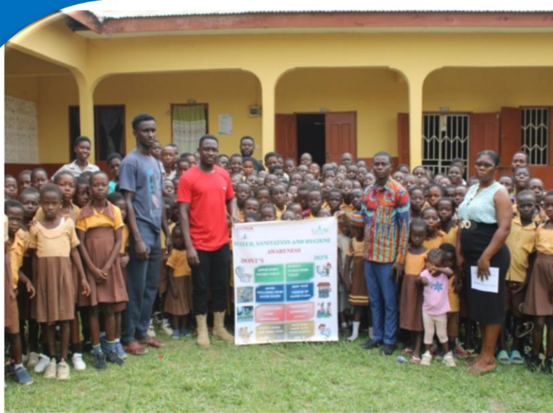
DELIVERY OF WASH AWARENESS BANNER TO ABOABO FIANKOMA SCHOOL