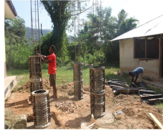
CONSTRUCTION OF POLYTANK STAND AT ABOABO FIANKOMA SCHOOL