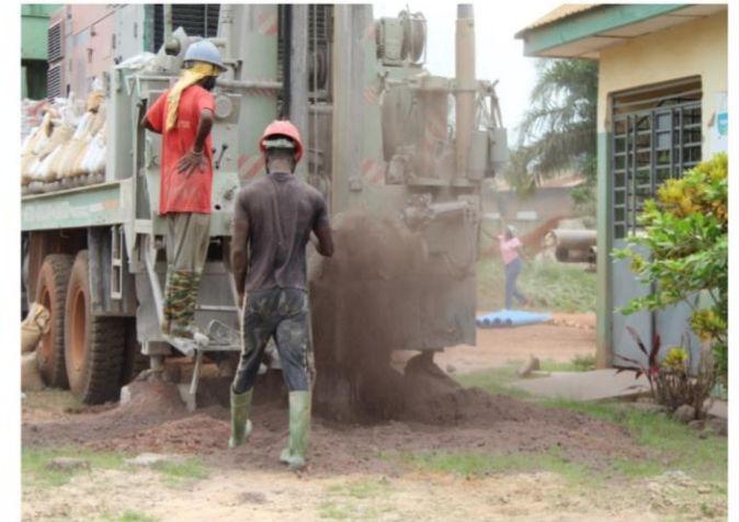
DRILLING OF DEEP BOREHOLE AT AMPATIA FREBOYE CHIP