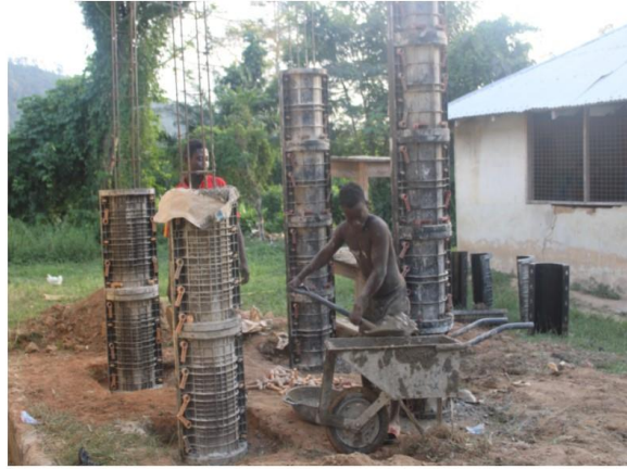
CONSTRUCTION OF POLYTANK STAND AT ABOABO FIANKOMA SCHOOL