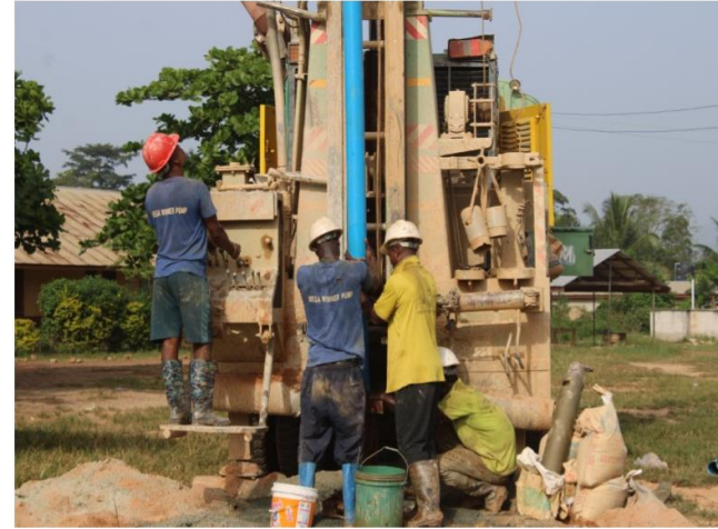
DRILLING OF DEEP BOREHOLE AT ANWIASO TWEAPEASE SCHOOL