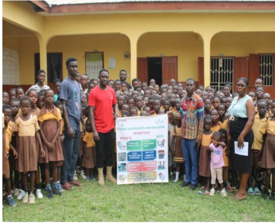
DELIVERY OF WASH AWARENESS BANNER TO ABOABO FIANKOMA SCHOOL