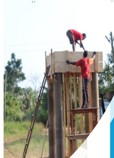
CONSTRUCTION AT ANWIASO TWEAPEASE SCHOOL