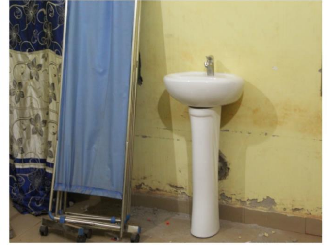
CONSTRUCTION MONITORING AT AMPATIA FREBOYE CHPS