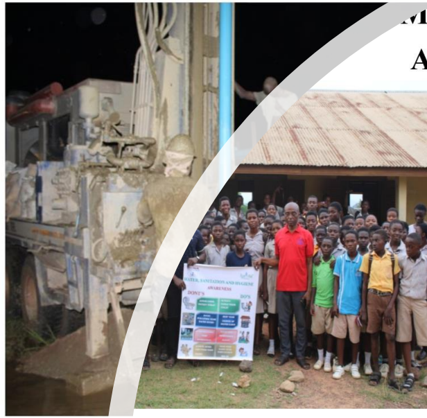
DRILLING OF WASH AWARENESS BANNER TO ANWIASO TWEAPEASE SCHOOL