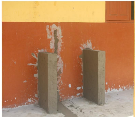
HANDWASHING STATION AT ABOABO