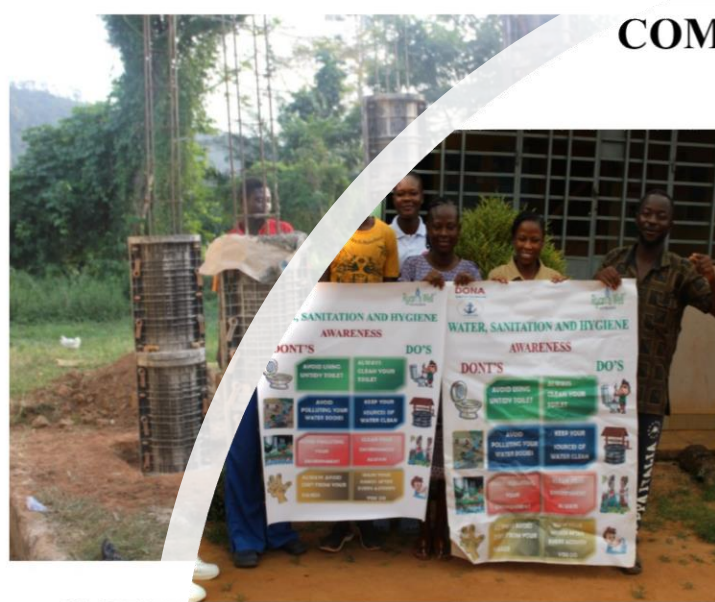
CONSTANT DELIVERY OF WASH AWARENESS BANNER TO AMPATIA FREBOYE CHIP