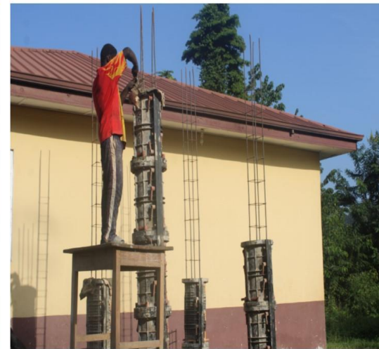
CONSTRUCTION OF POLYTANK STAND AT ABOABO FIANKOMA SCHOOL