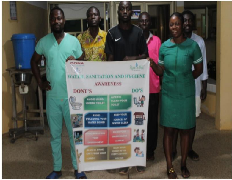
DELIVERY OF WASH AWARENESS BANNER AT DEGANSO ASAREKROM CHPS