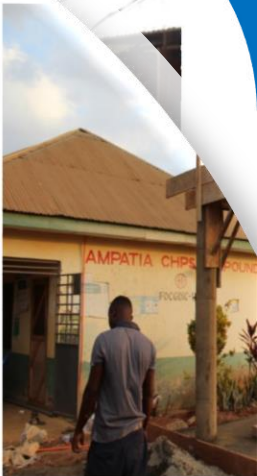
CONSTRUCTION STAND AT AMPATIA FREBOYE CHIP