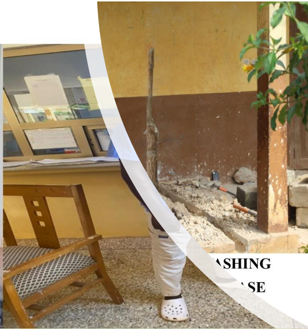
WASHING AT ANWIASO TWEAPEASE SCHOOL