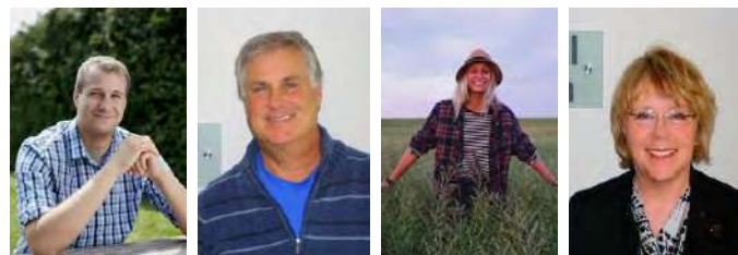
The Ryan's Well Staff