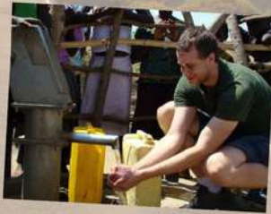
Ryan's Well celebrates 1000th well! 2015