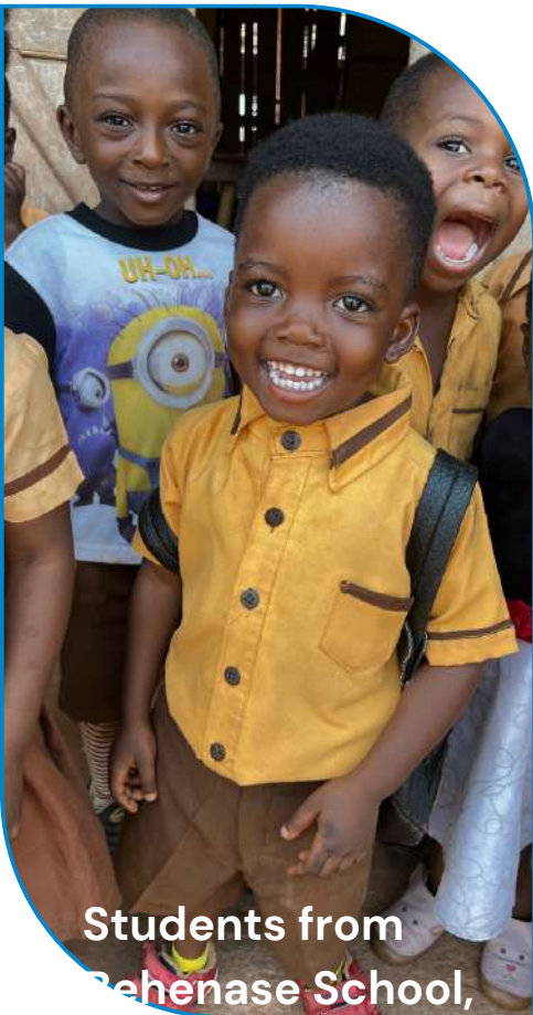
Students from Behenase School,